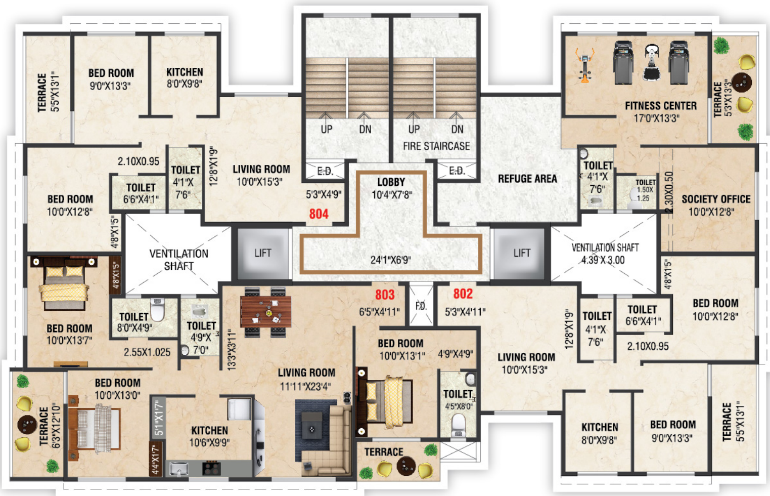
8th Floor Plan