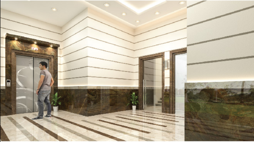
Ground Floor Entrance Lobby