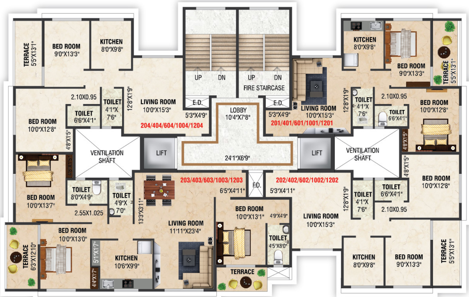
Typical 2nd, 4th, 6th, 10th & 12th Floor Plan